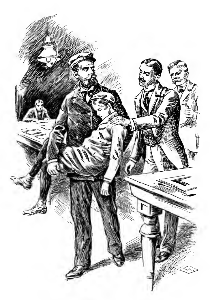
HE TOOK THE UNCONSCIOUS BOY IN HIS ARMS.